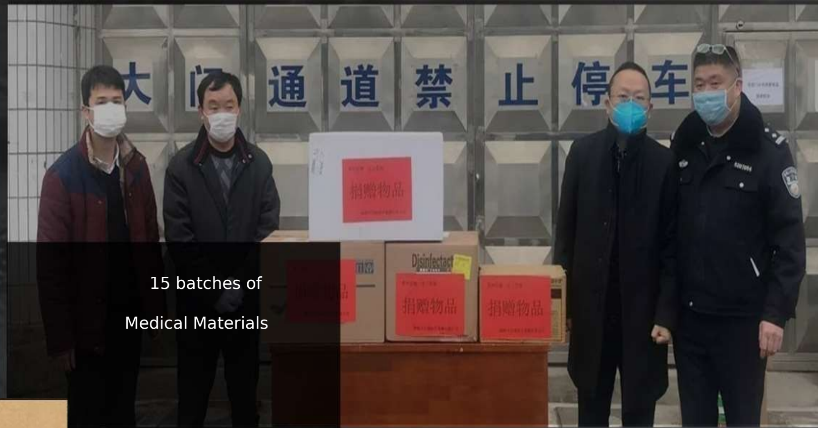
15 batches of Medical Materials

The subsidiaries of GoldenMed donated 15 batch of medical materials like goggles, masks and disinfectant to Medical security administrations and hospitals in different provinces.